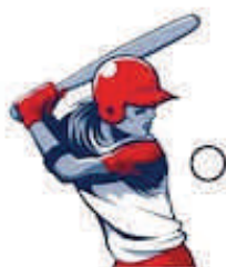
High School and Junior High Softball Team

O W I A A S J D E F K B K E B U O K I K A C B J L U D H E E Z L D A C Y X W E A L A L C L W Y I I I U M O N Z S A G A I L Q V J T L L R N T F M H K N D J E S S I E A E B A B I P D N H L Q V L X Y Y I J R E N A Y J S I Y B A M E X T N Y O E R E A A U D D A H F O B C N F B N S H D H C D C M A V E R Y E N A I V E K D M E I C A R G T A S G W U G I F U L B U J X H O L S A K S E R O L Y A T R N B C A M E R O N V K A F X W T W U T I M R X R J M Y T P O